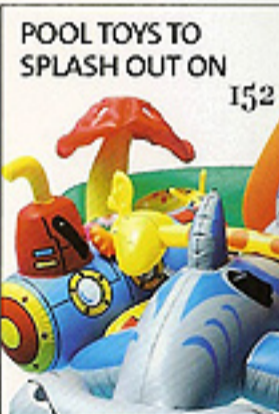
POOL TOYS TO SPLASH OUT ON 152

IDYLIC HIDEAWAYS AND THEY'RE JUST HOURS AWAY!