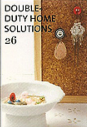
DOUBLE- DUTY HOME SOLUTIONS 26

SAVE AN EXTRA $4,000 A YEAR – WE TELL YOU HOW!